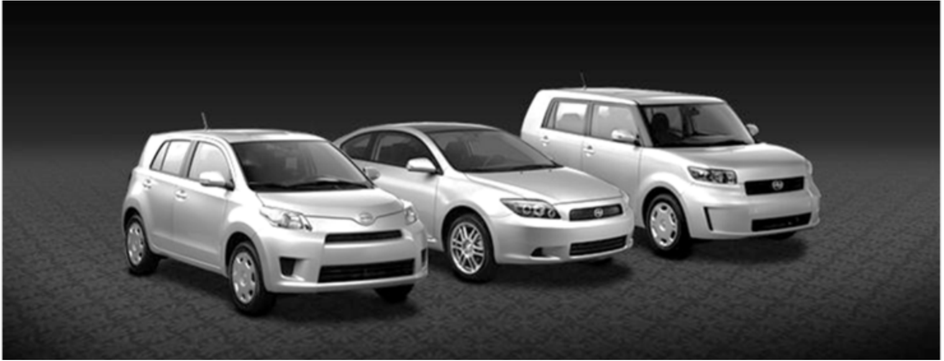
Figure 8-1. The Scion Brand of cars; the xD, tC, and xB.